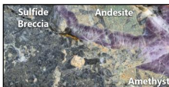
SAD-14-04: 6.1m @ 138gpt Ag, 0.8gpt Au, 0.19% Cu, 3.17% Zn+Pb